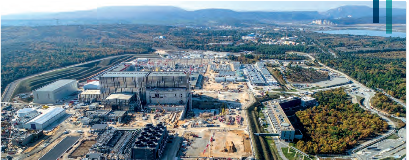
Provence is home to ITER: the world's largest scientific project around nuclear fusion involving 35 countries including India.

Provence and India enjoy a long history of trade, friendship, and exchange. Cooperation dates back to the 16th century when Marseille was the European gateway for the Indian textile industry. Today it is as vibrant as ever with initiatives such as the opening of the first Indian general consulate outside of Paris in Marseille. The privileged India-Provence relationship offers enormous advantages and diverse opportunities for Indian entrepreneurs seeking to invest in the Provence area.