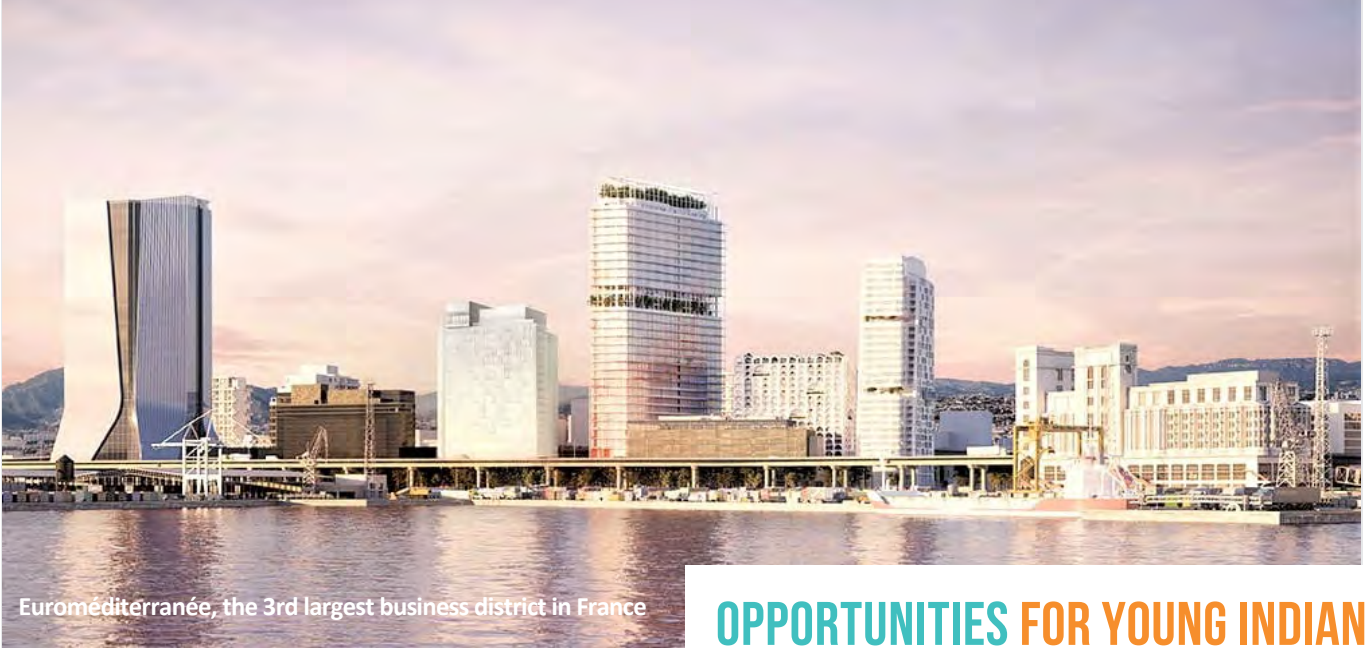
Euroméditerranée, the 3rd largest business district in France