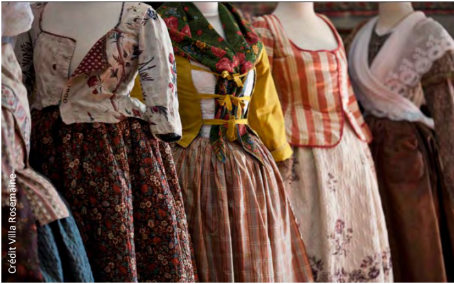
From the 16th century onwards, cotton made its appearance in France via the port of Marseille, and the brightly coloured printed cotton fabrics known as indiennes became a coveted item.