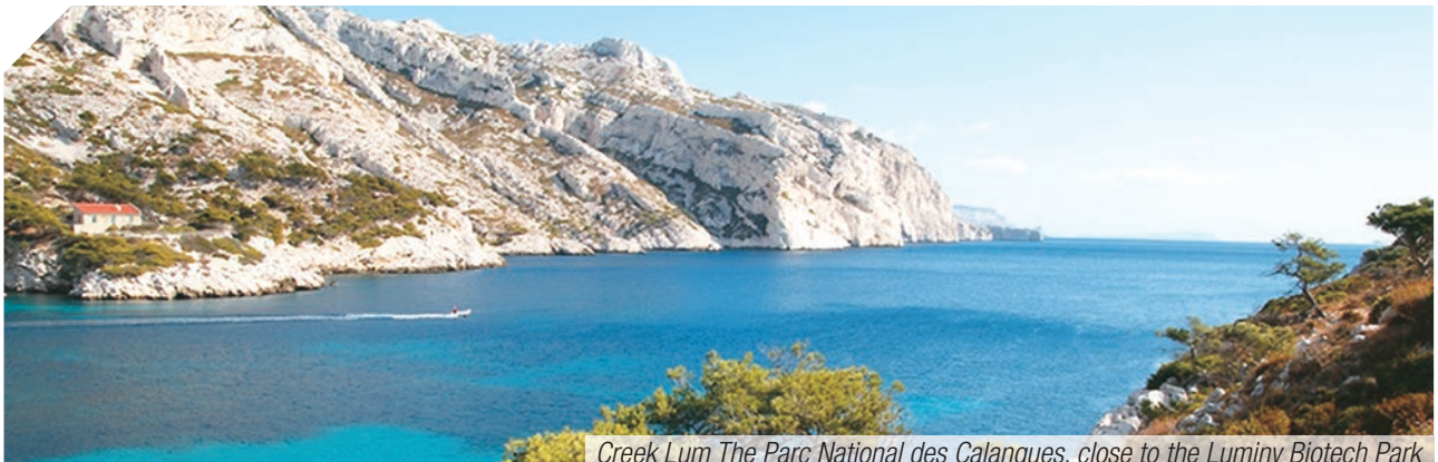
Creek Lum The Parc National des Calanques, close to the Luminy Biotech Park

Business leaders and entrepreneurs come from all over the world for the quality of life and the competitive costs.